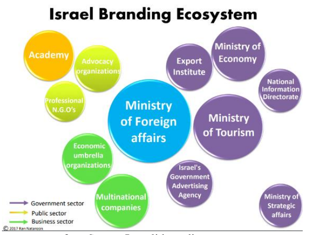
figure: Izraeli branding ecosystem

The Ministry of Foreign Affairs (MFA) is the central actor, which looks at the country brand building as non-tourism marketing but works closely with the Ministry of Tourism. ( Figure 2 ) The MFA has recently created the "Creative Energy", while the Ministry of Tourism introduced the "Land of Creation" slogan.