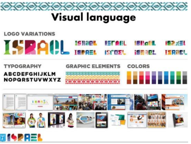
3. figure: Visual language of the Nation brand