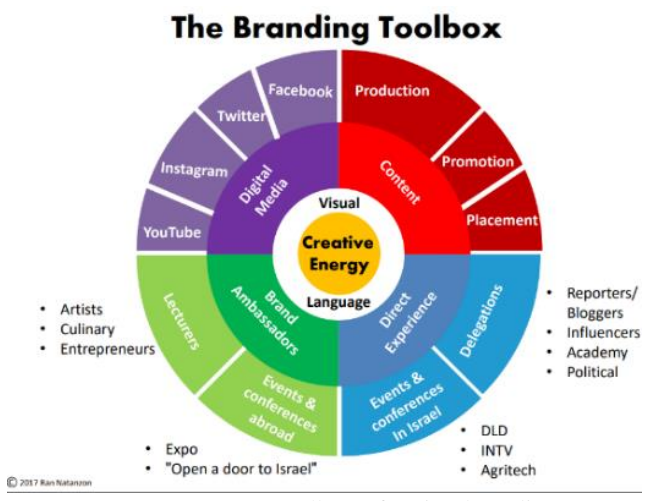
4. figure : Toolbox of nation branding

The MFA also puts a strong emphasis on training their diplomats. Later they can contribute to the promotion of the innovative-economy-focused country brand at their missions. In addition, foreign diplomats accredited to Israel are also involved in innovation hasbara programs. For example, by study tours which ensure that participants send reports to their headquarters about the state's outstanding research and development results and communicate Israel's willingness to cooperate in exchanging models and best practices.